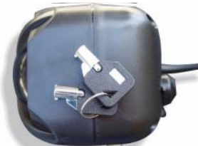
Battery backed up Siren