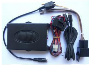
Dynapage Cellular pager