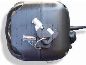
Battery backed up Siren